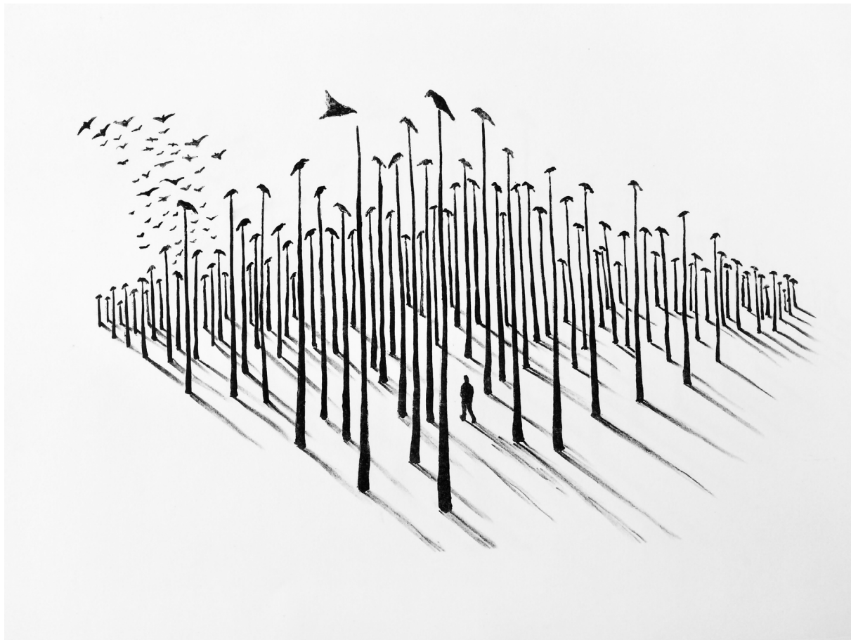
“He Just Couldn’t Shake the Feeling.”