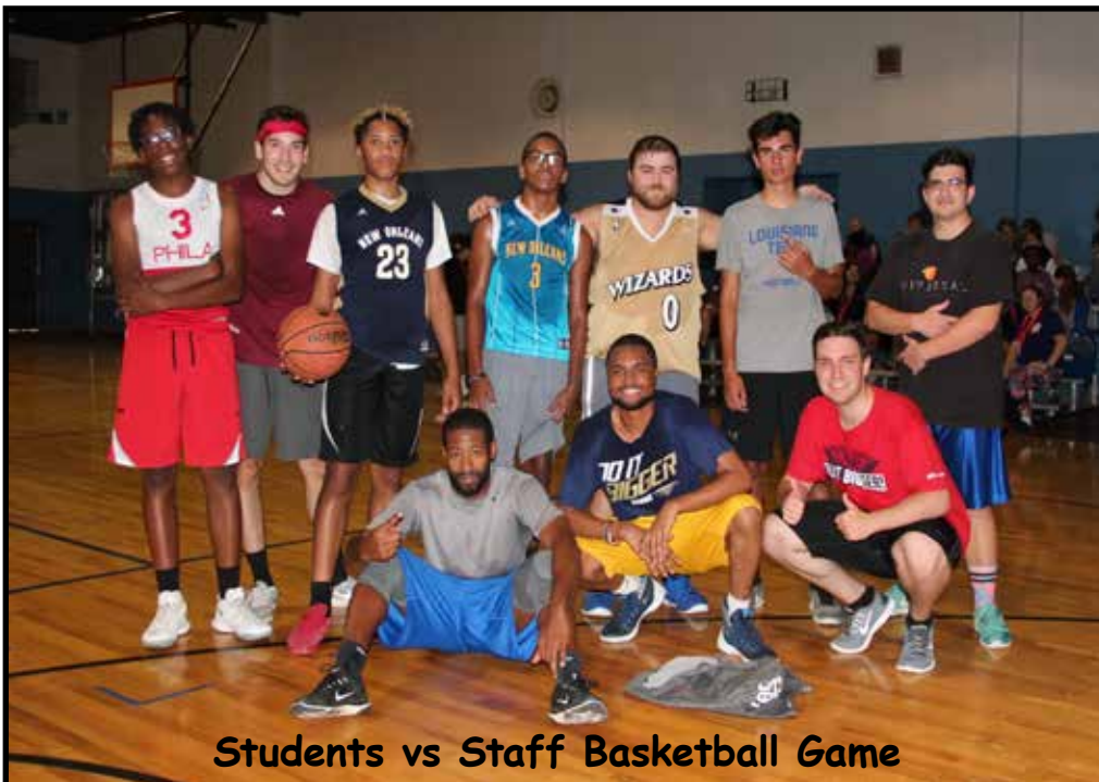
Students vs Staff Basketball Game