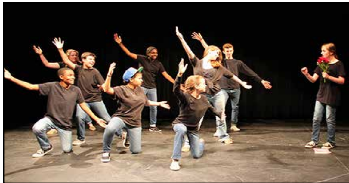
Above: Theatre students entertain the audience with a scene, Promposal , from their original 20-minute short play What is Love . The students wrote, directed, and designed the five scenes that comprise the play.