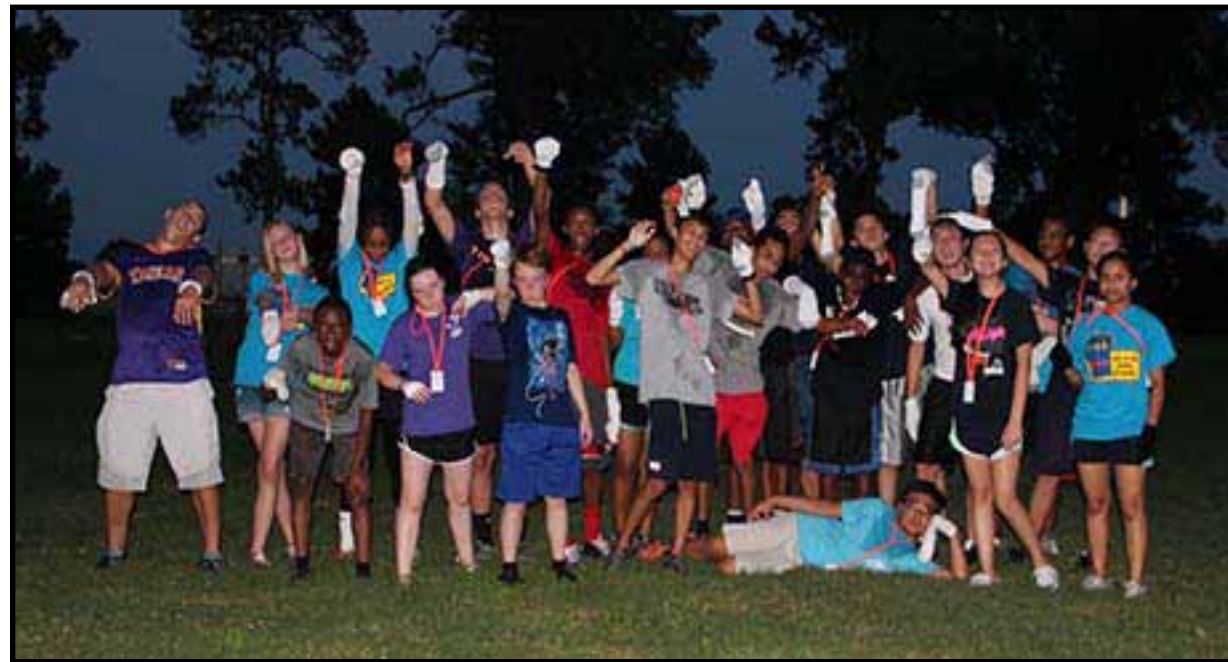
Zombies come out at night!