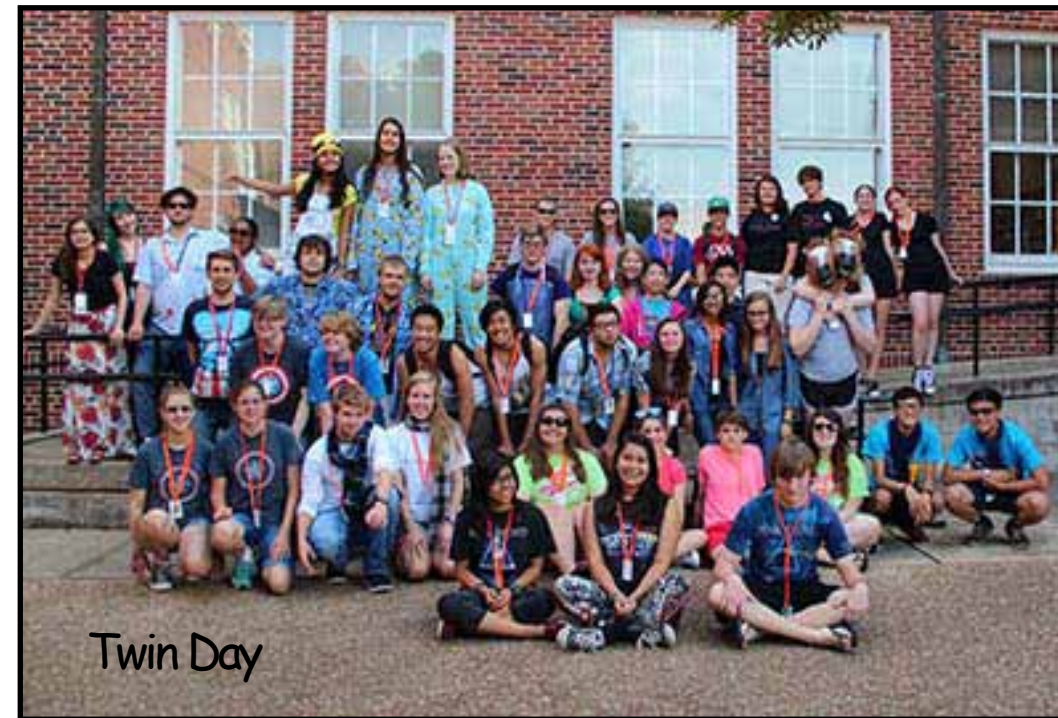
ADVANCERs love each other so much that Twin Day has become an annual event!