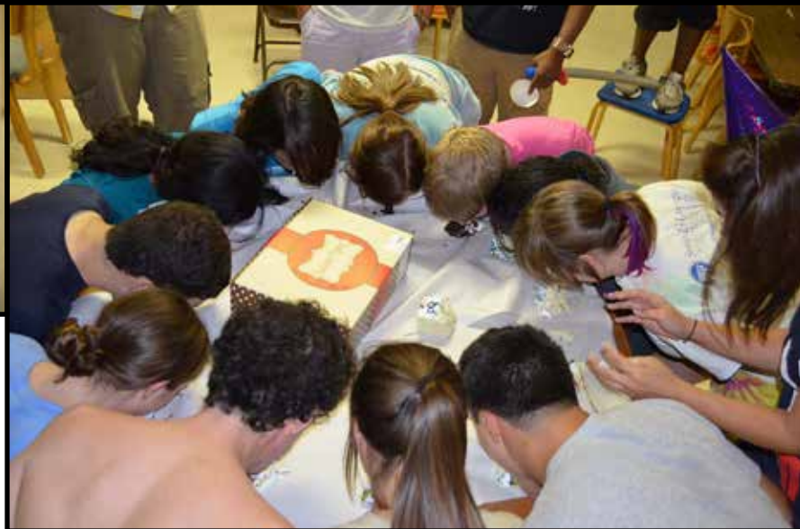
While staff members work extremely long hours, they also manage to have fun and become great friends.