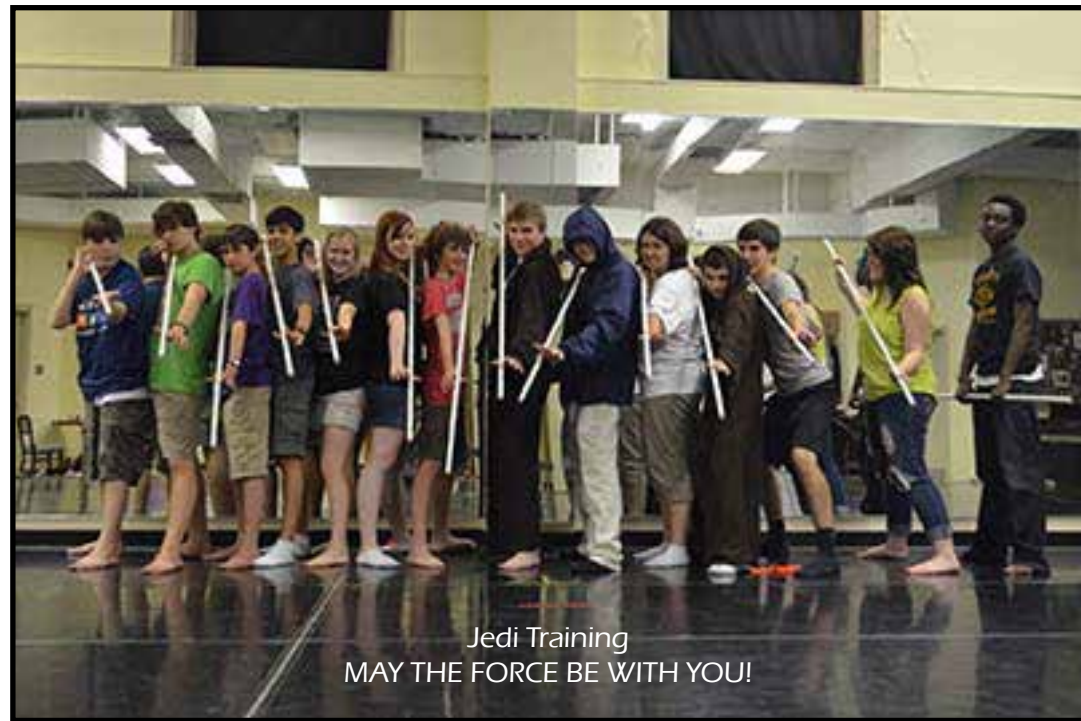
Jedi Training MAY THE FORCE BE WITH YOU!