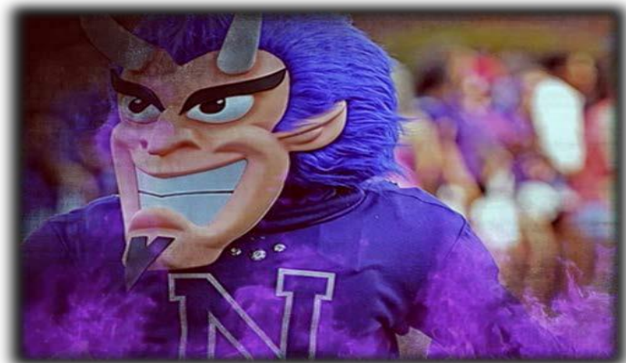
Vic the Demon

NSU also hosts the Louisiana Scholars' College, Louisiana's designated Honors College in the Liberal Arts and Sciences, and the Louisiana School for Math, Science, and the Arts.