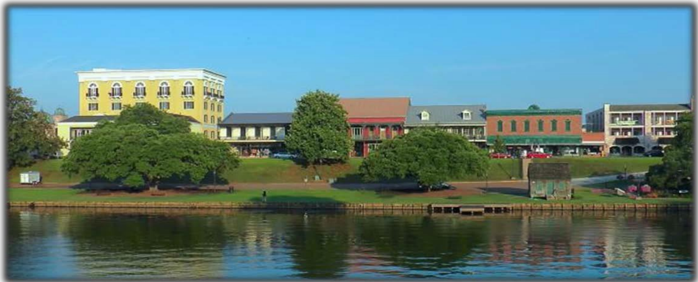
3 Front Street & Riverbank

Natchitoches (Nack-a-tish), is the oldest settlement in the Louisiana Purchase. Established in 1714, Natchitoches' cultural richness lies in its perfect mix of European and Cajun traditions. This can be appreciated through its architecture, heritage and lifestyle. The City of Natchitoches is the heart of Natchitoches Parish.