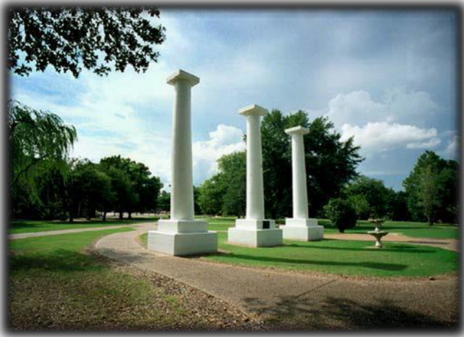
1 Three Columns