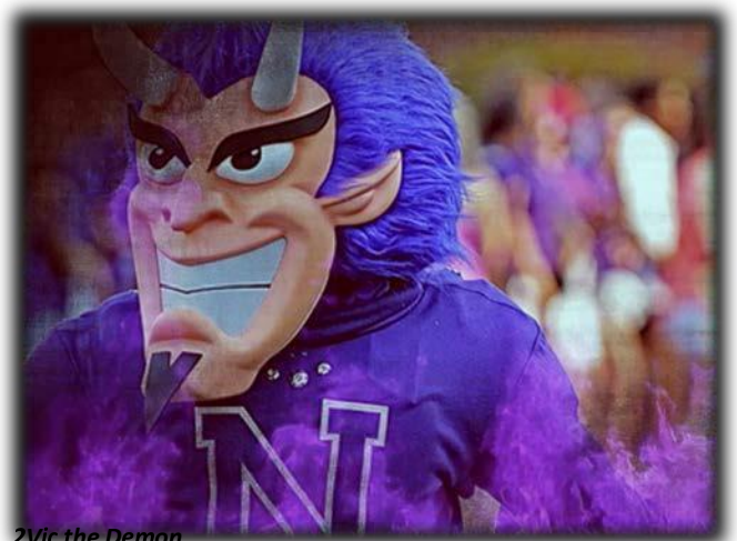
2 Vic the Demon