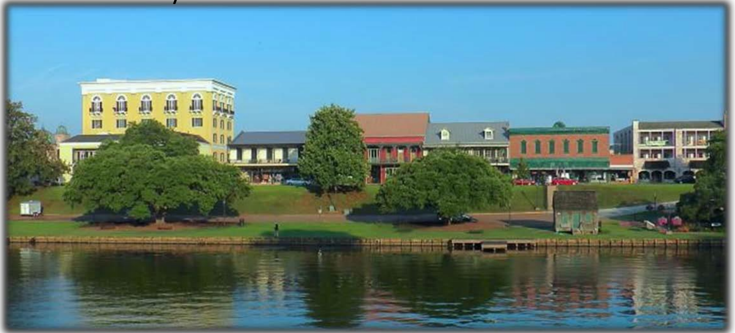
3Front Street & Riverbank

Natchitoches (Nack-a-tish), is the oldest settlement in the Louisiana Purchase. Established in 1714, Natchitoches' cultural richness lies in its perfect mix of European and Cajun traditions. This can be appreciated through its architecture, heritage and lifestyle. The City of Natchitoches is the heart of Natchitoches Parish.